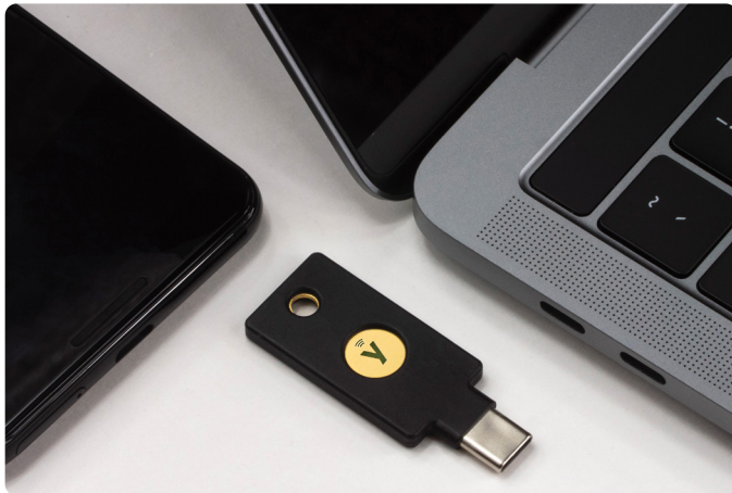
YubiKeys deliver strong user authentication across platforms and devices

Yubico is the principal inventor of the WebAuthn/FIDO2 and Fido U2F authentication standards adopted by the FIDO Alliance and is the first company to produce the U2F security key and a multi-protocol FIDO2 authenticator.